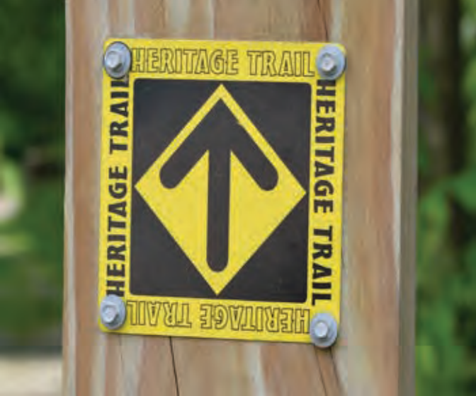
Yellow trail markers with black directional arrows lead the way along the Heritage Trail.

On December 1, 1984, Jeannie Wiley, staff writer for The (Findlay) Courier , wrote, "Despite the traffic that rushes by on U.S. 224, Indian Green Cemetery stands today as it has for more than 100 years—a quiet, grassy clearing, protected from the world by willow trees and the Blanchard River." History tells us that the tombstones identify the final resting place for early pioneers and that before the pioneers, the land was used as an Indian village and burial grounds. Indian Green Cemetery is rich in history, and a fitting destination along the Heritage Trail.