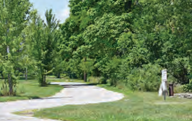
The Heritage Trail mostly follows the course of the Blanchard River and offers scenic views through wetlands, woodlands, and open space. Historic points of interest include (above) the Great Karg Well Historical Site.