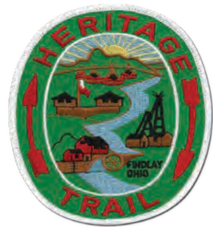
Contact the Hancock Park District Administrative Office for details on earning your Heritage Trail Patch.