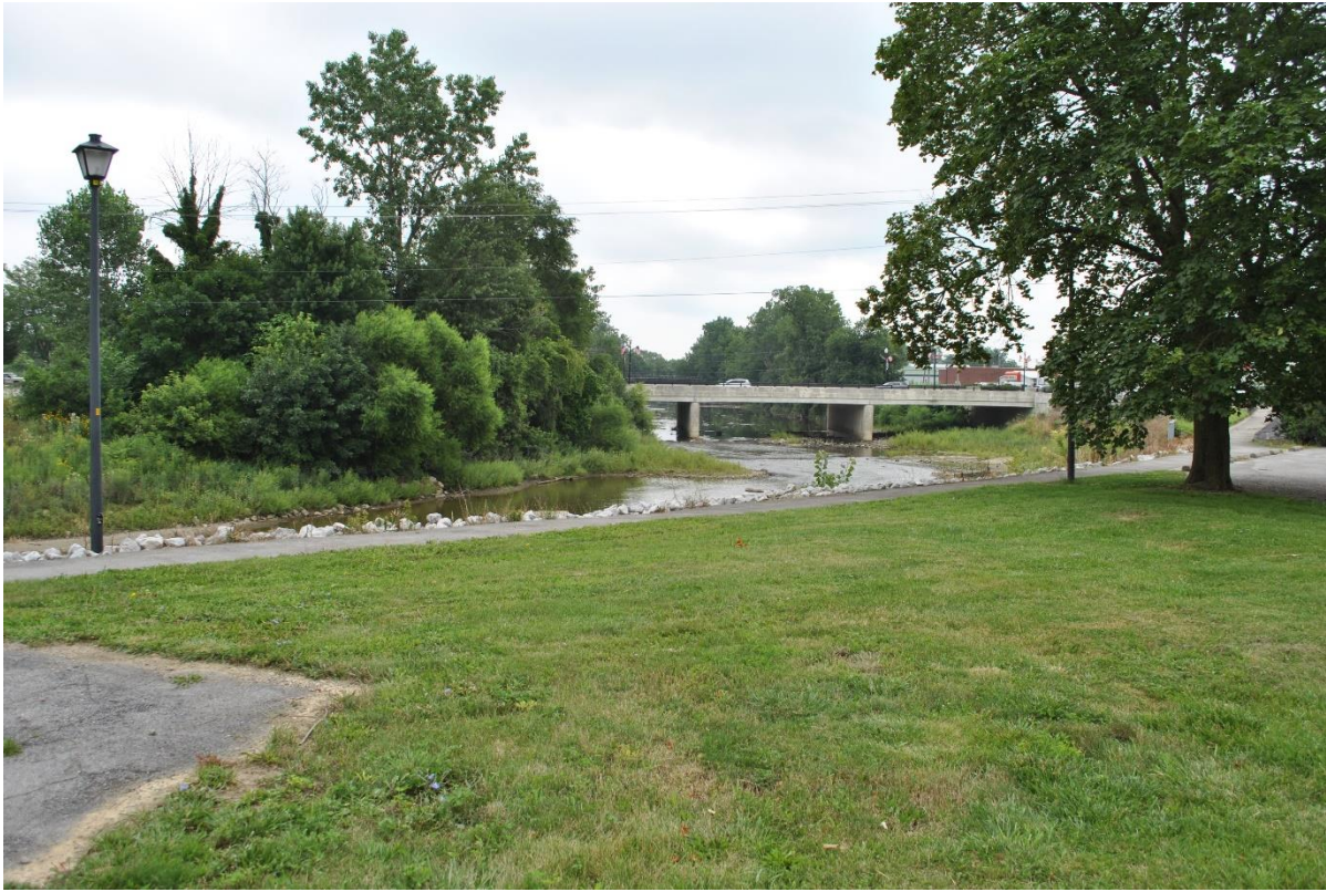
Parcel 560000170360 with a view of the Blanchard River