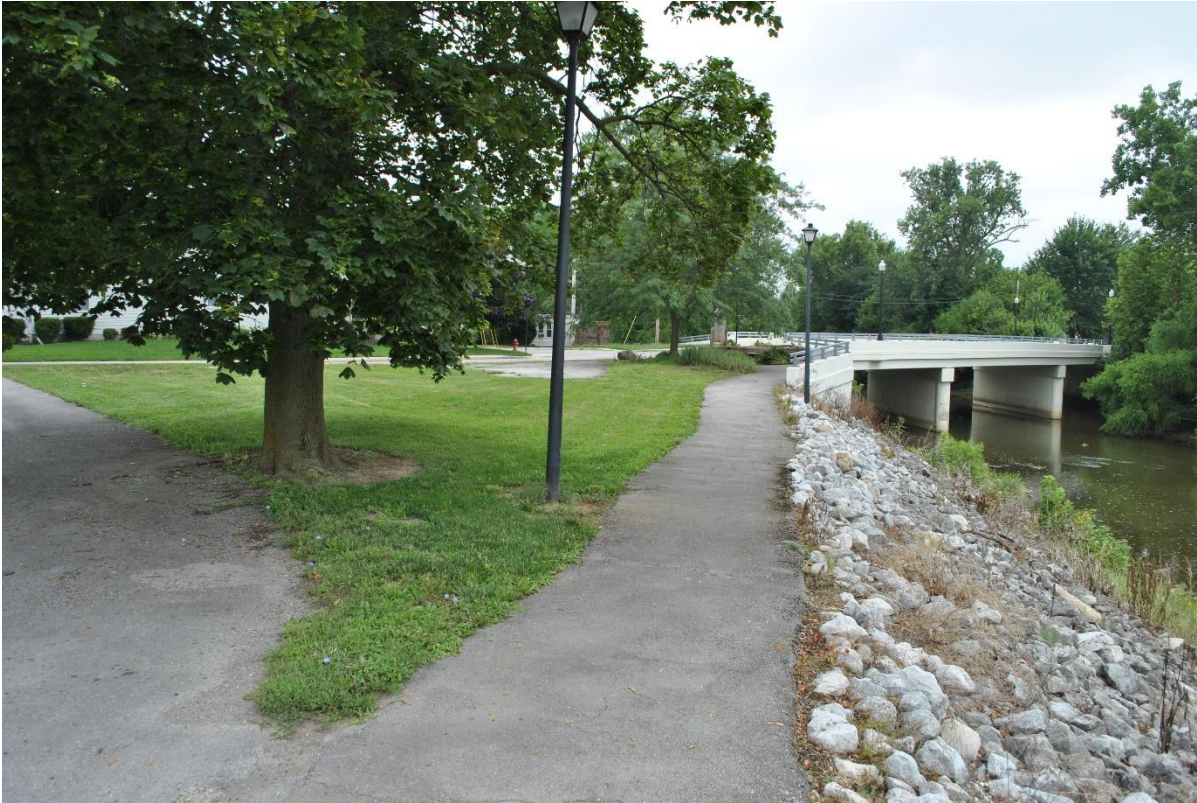
Parcel 560000170360 located adjacent to Riverwalk West