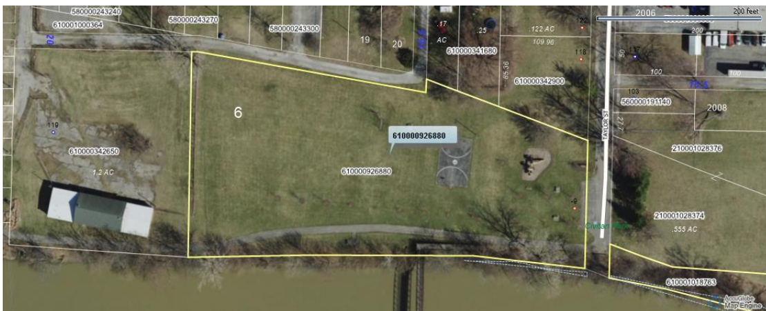
Civitan Park and the Blanchard River Greenway Trail