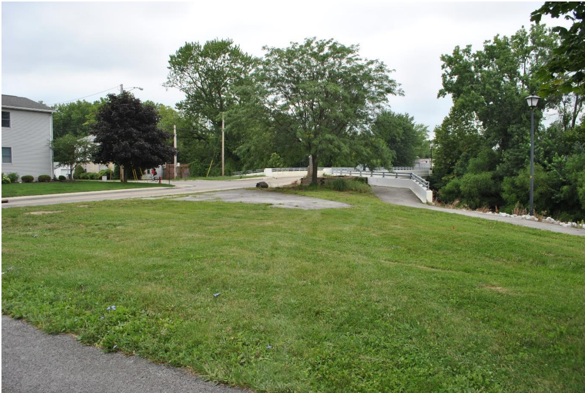
Parcel 560000170360 with a view of Cory Street and the Riverwalk Trailhead