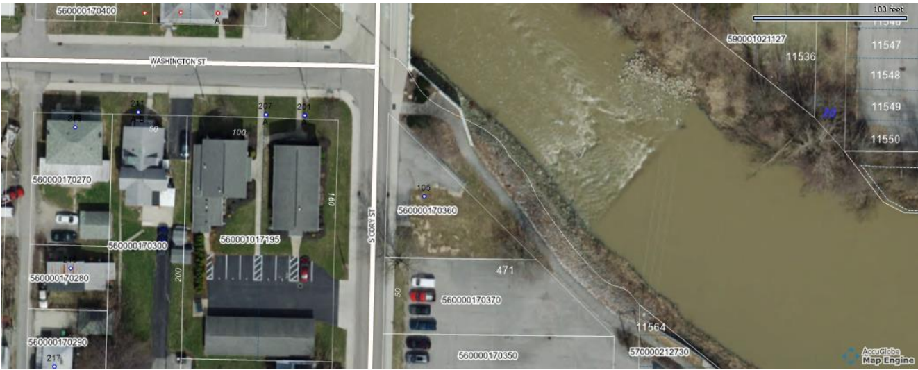
Parcel 560000170360; west of Cory Street, southwest of the Riverwalk