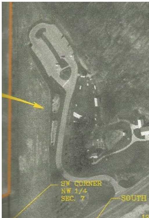
Litzenberg Memorial Woods The arrow points to the overflow parking lot.

The existing parking lot is deteriorating, especially along the driveway near the parking lot where drainage issues exist. It has created an ongoing maintenance challenge and raised a concern about how the driveway condition may affect customer service and visitation (not unlike the issues raised with the Big Oaks Activity Area parking lot before it was removed and replaced). Walkway design and deterioration has created a lack of accessibility to facilities, amenities, and activity sites. A parking lot with 50 parking spaces may not be enough to support visitation when the Activity Barn is rented, the shelter is rented, and programs are underway, and when general use also occurs. Moreover, a paved overflow parking lot would be useful when conducting traditional special events and when planning for future programs and special events.