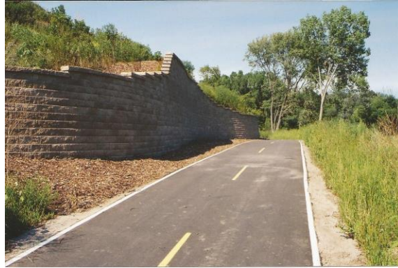
Trail Striping Concept for the Blanchard River Greenway Trail

Striping is part of a larger plan to make improvements aimed at raising awareness of and appreciation for the trail, promoting trail use, improving the quality of the trail experience, identifying the organization responsible for managing and maintaining the trail, and upgrading and modernizing the trail. In addition to striping, wayfinding and directional signs will be installed at trailheads and at other strategic locations along the trail. Message centers with large trail maps will be installed at River Park locations (see Resolution 2021-09).