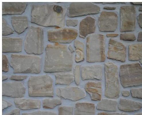
Proposed rendering by Romtec Company showing Brown County Rubble as the exterior stone.

Request to approve Resolution 2021-10 regarding additional appropriation within the Auditor’s certification and Park Commissioners to appropriate in the General Fund in the amount of $3,000.00 for fireplace and chimney repairs at multiple park locations: Routine maintenance of fireplaces and chimneys at Oakwoods Nature Preserve, Litzenberg Memorial Woods, and Riverbend Recreation Area identified the need for repairs to fireplaces and chimneys. Since repairs need to be made before fireplaces and chimneys can be used (for safety reasons and because program and rental facilities depend on the availability of fireplaces and chimneys) and the 2021 budget lacks the necessary flexibility and contingency funds, an additional appropriation is requested so that the work can proceed as soon as possible (see Resolution 2021-10).