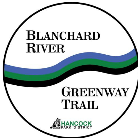
Standard Wayfinding Sign